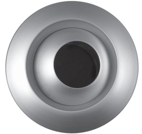
KAM-W by MADEL®

Air Pattern | Adjustable directional jet, long throw.