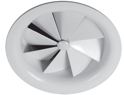
AXP by MADEL®