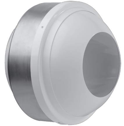
KAM-D by MADEL®

Air Pattern | Adjustable directional jet, long throw.